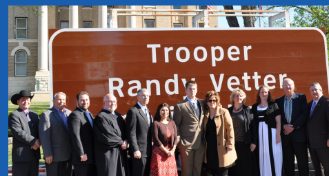
"Friends, Family Unveil signs for Trooper Randy Vetter Memorial Highway," Commissioner Precinct 1 News, Hays County Commissioner, posted July 13, 2018, https://hayscountytx.com/2018/07/13/friends-family-unveil-signs-for-trooper-randy-vetter-memorial-highway/

memorialization. Research surrounding this project engages with multiple disciplines, including geography, urban planning, public history, and political science.